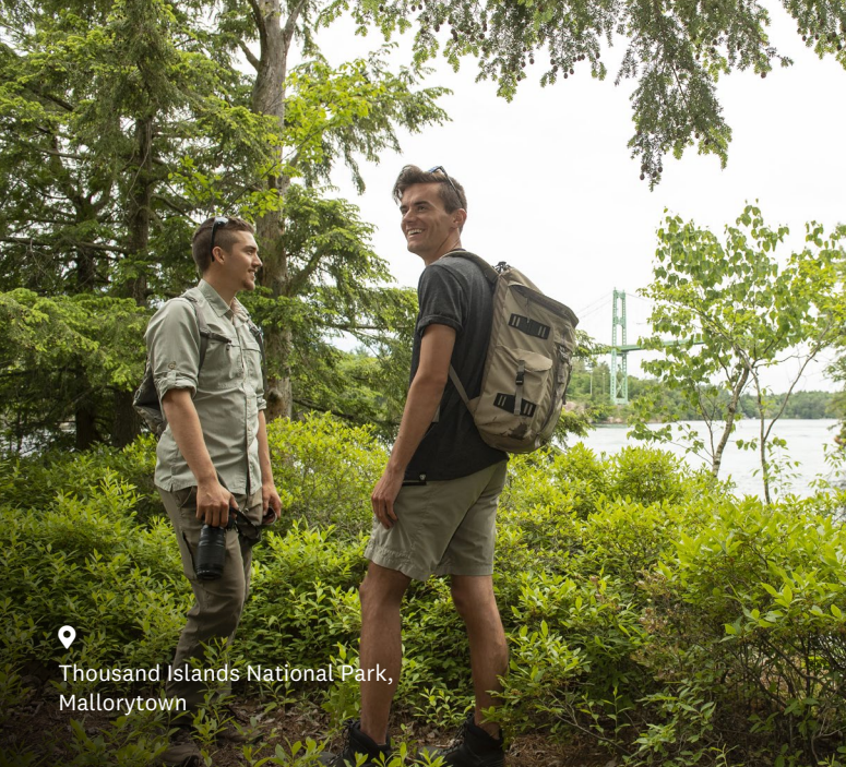
Thousand Islands National Park, Mallorytown